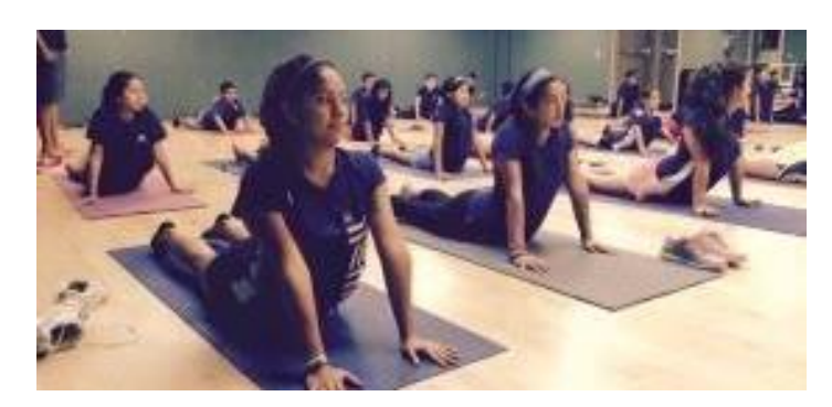
Students participated in three yoga sessions at the Santa Barbara Athletic Club