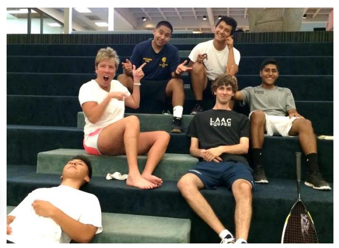
Alumni squash day!